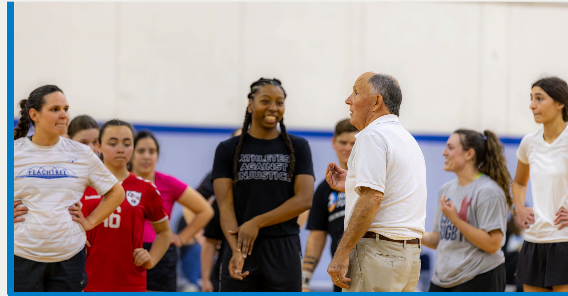
Development & Skills Camp