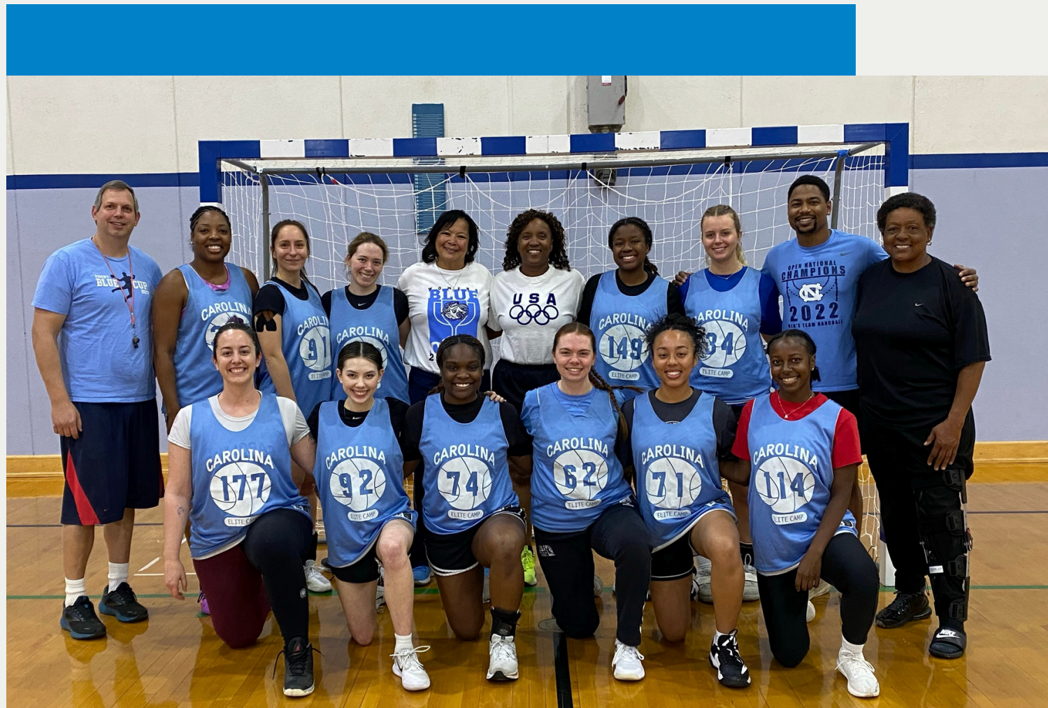
Regional Development Camp in North Carolina.

Inspired by the spirit of the U.S. Olympic Festival (1978–1995) , the Handball Futures Festival is our flagship event to elevate women's handball in the United States with men's and wheelchair disciplines to follow.